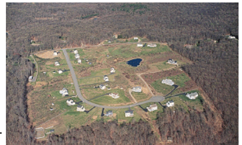
How forest fragmentation starts...

Forests prevent erosion, by slowing down rain water runoff. This also helps prevent flooding. Water quality benefits