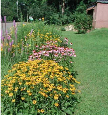
Established Raingarden in Maplewood

Monday & Tuesday, June 14 – 15, 2010 & Wednesday, August 11 th , 2010