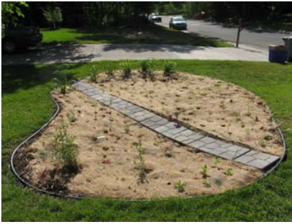
New Rain Garden in Duluth